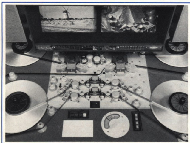
ST 921 top view

plus extras: ST 59/64/69/76/151/152/192/193/260/5001