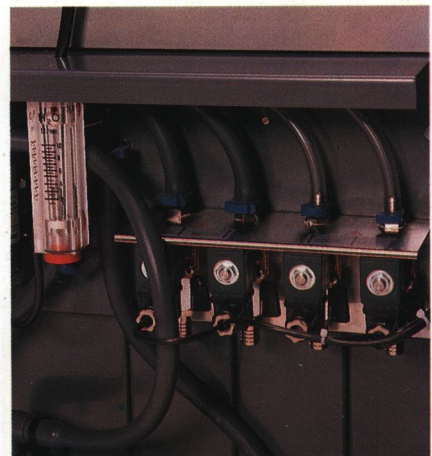
Wash control and saver valves

agitation gas economisers and electric power savers. There is the efficiency of cooling mechanisms to refine temperature balancing on important process steps. Then there's double solution cleaning on particular baths (with selective fine filtering to enhance universal straining). And multiple air pumps to agitate chemicals evenly, vigorously and without cross contamination. All essential, all standard and all adding up to outstanding efficiency.