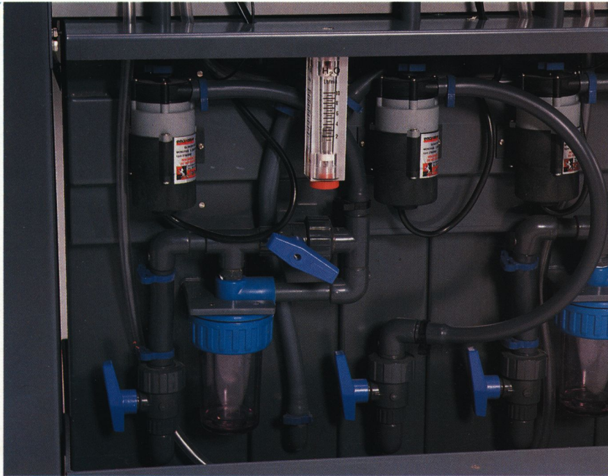
Circulation pumps, filters, flow valves and isolation taps.

ne. All are considered essential. The powerful film lift frame is fitted with touch stop sensors above, below and on all four corners — to gently avoid all damage. Low voltage everywhere (except pumps, fans and heaters) minimises electrical risk and invites the addition of a whole machine drive DC power pack for ultimate power failure protection. A service lift winding handle is built in as standard. Film racks are positively identified through all the tanks and vital components are protected by status sensors and shut down alarms. Safety that protects your investment and your reputation.