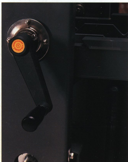
Safety lift winding handle

Safety for operator, security for processing and protection for the machi-